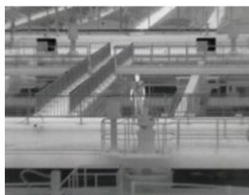
Optical zoom 70mm