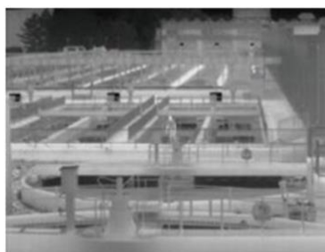
Optical zoom 35mm

ITAR-FREE THERMAL OPTICAL ZOOM BLOCK CAMERA MODULE