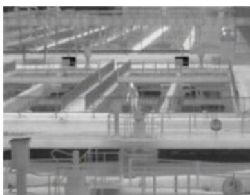
Optical zoom 50mm